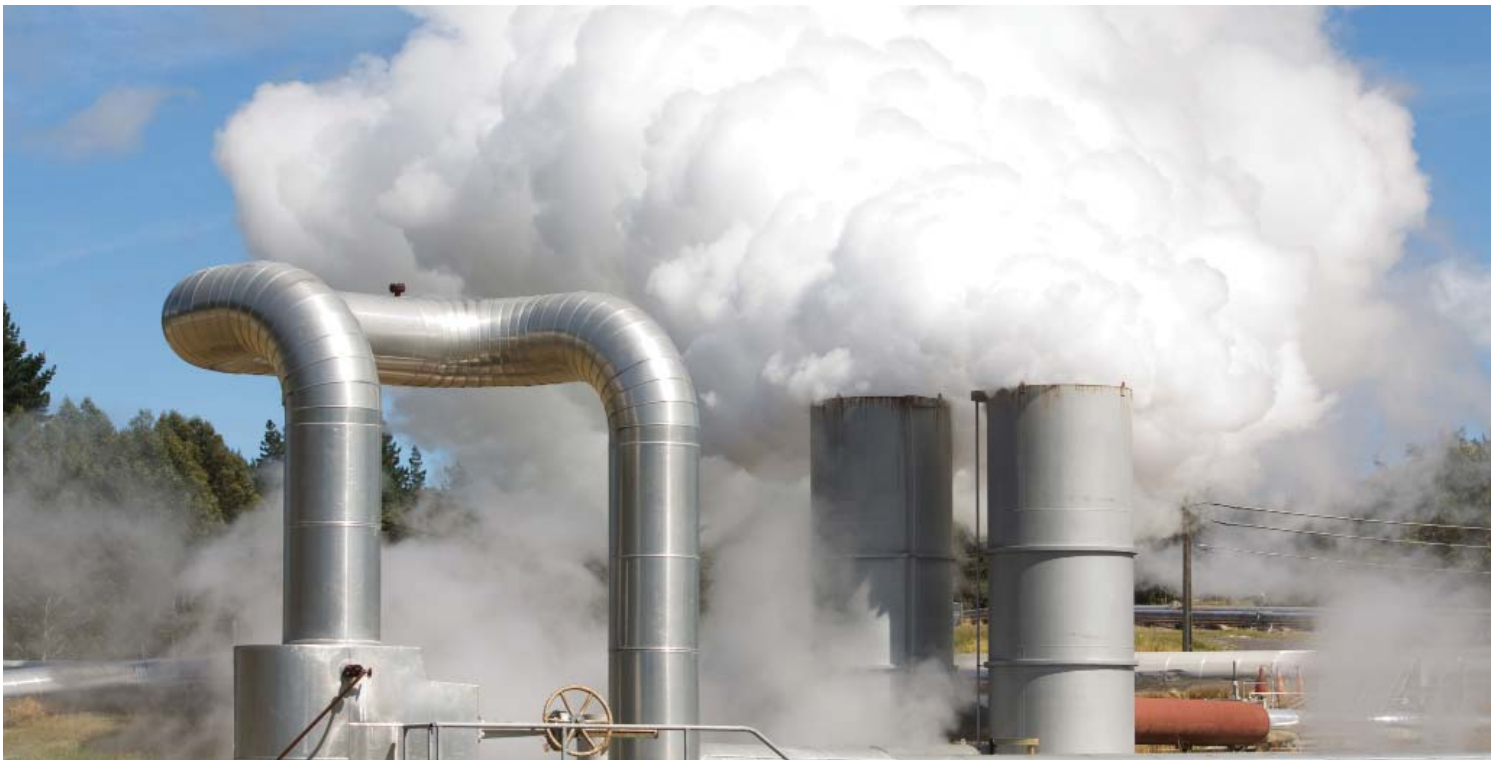
Geothermal power station.

Our review identified two issues that hinder a more effective program. First, operational orders for geothermal resources, which were issued by BLM to implement and enforce Federal regulations, were approved more than 30 years ago and fail to account for technological advancements. BLM personnel reported that four of the seven orders are no longer applicable, as the provisions have been incorporated into the current Federal regulations.