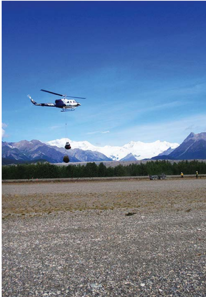
Alaska Fire Crew team at work.

To further safeguard the check-writing program from fraud, waste, and mismanagement, OIG recommended that all check-writing bureaus evaluate their monthly reconciliation process and that DOI require training more frequently than every 3 years for check writers and their approving officials. DOI concurred with both recommendations.