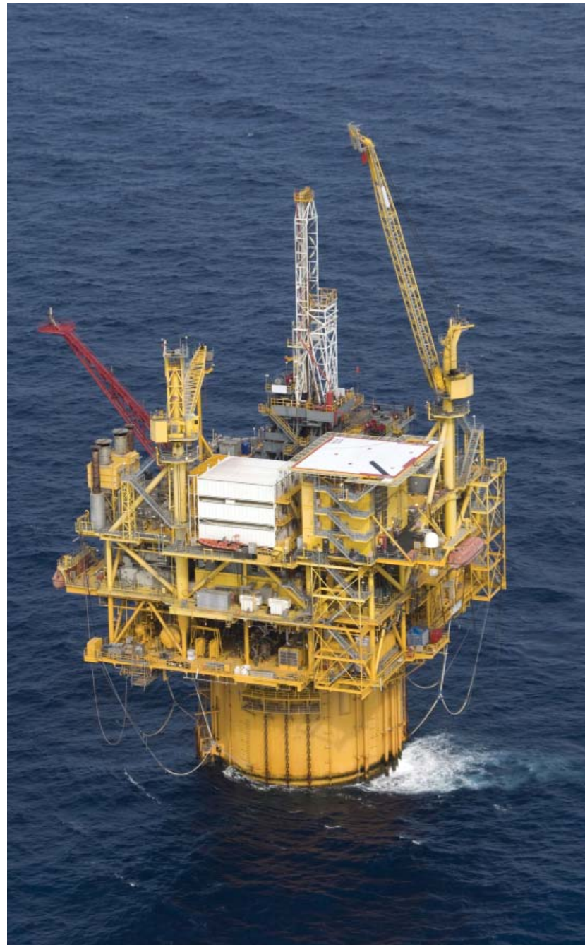
Offshore drilling rig in the Gulf of Mexico.

By filtering the water, the contractor negated the authenticity of the water samples, which decreased regulatory oversight on W&T and reduced additional costs to which W&T may have been subjected.