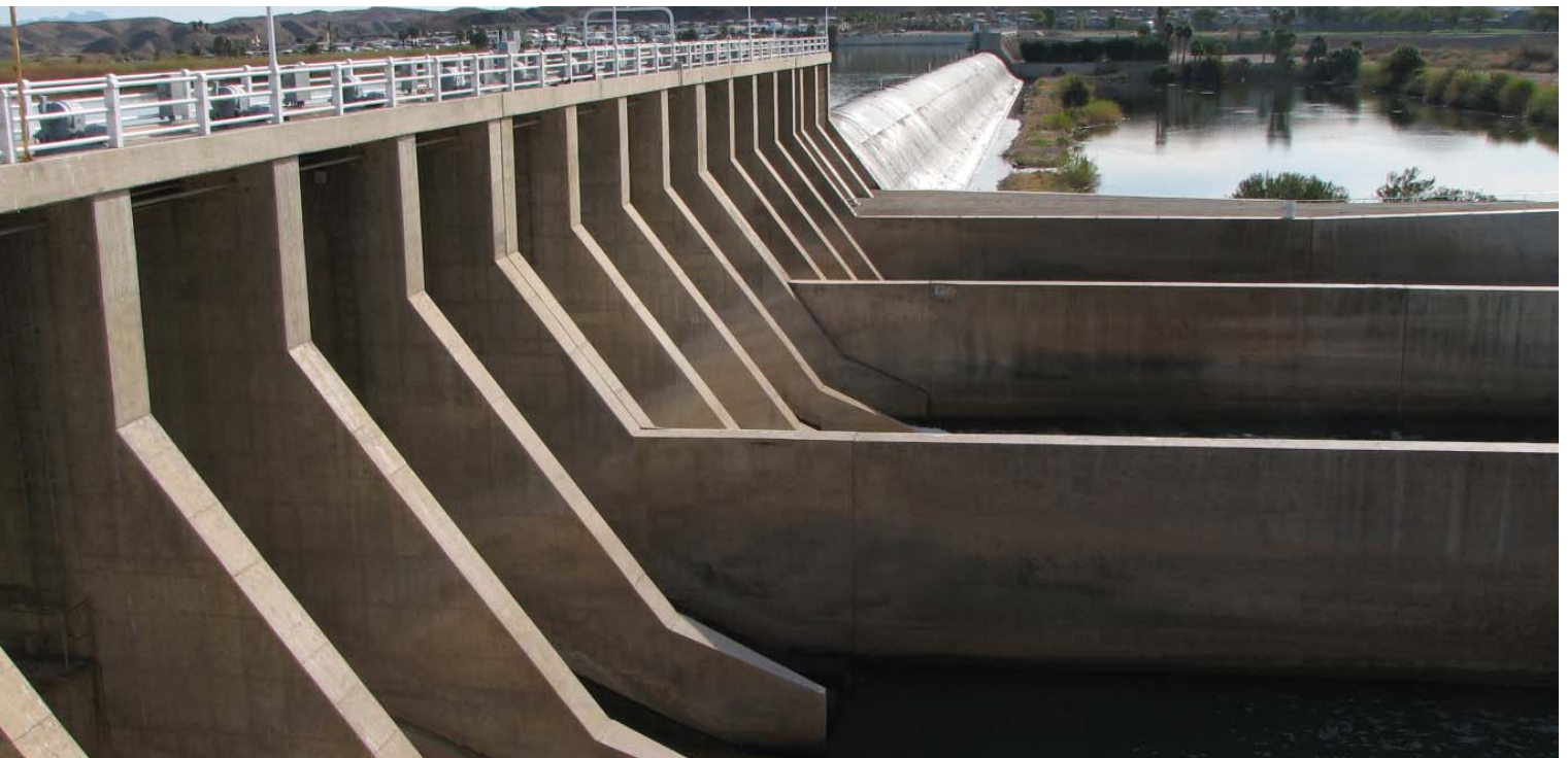
The Imperial Dam on the Colorado River, northeast of Yuma, AZ.

We found that OSM, BLM, and NPS either have no requirement for EAPs to be in place for all high-hazard dams under their purview, or have not adequately reviewed, exercised, or formalized the EAPs that are in place. We also found that none of the three bureaus have a written policy requiring after-action reports to be prepared following EAP exercises, and when after-action reports are prepared, recommended corrective actions in these reports are not tracked for implementation.