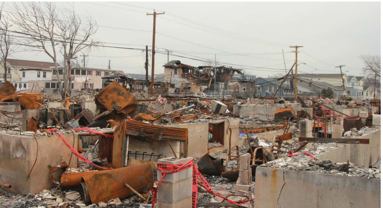
Damage to Breezy Point, NY, resulting from Super Storm Sandy.

In the wake of one of the costliest natural disasters in U.S. history, DOI mobilized resources to expedite storm recovery on impacted Federal and tribal lands. OIG responded accordingly, as those emergency declarations invoked acquisition flexibilities authorized in the Federal Acquisition Regulation and gave rise to unusual and compelling needs for supplies and services.